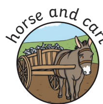
horse and cart