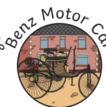
Benz Motor Car