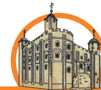
Tower of London