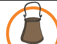
leather water bucket